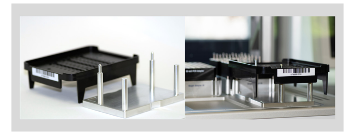
Figure 3: The MagNa Pure elution-rack (black) is directly placed into the LHS via a special adapter plate (metal). To eliminate sample exchange inadvertently, the purified DNA/RNAs are transferred by placing the sample rack into the LHS at position 8.

LHS control software and defines the pipetting steps (Figure 1). Furthermore, positive and negative controls are automatically added by the software to all PCRs used in the PCR-setup. The second output file is transferred to the LightCycler480 control computer and defines the plate layout for the PCR analyses. Also, the software calculates the amounts of PCR mixes and provides this information to the user. In summary, the new middleware software automatically creates a robot control file, adds all necessary controls, and generates a LightCycler480 plate layout (Figure 1).